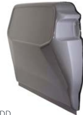
MV3-0501 H DD